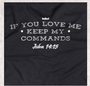
JOHN 14:15 SKU# 138