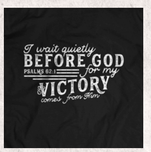
PS 62:1 SKU# 146