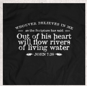
JOHN 7:38 SKU# 145