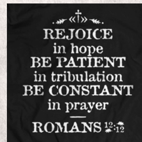
ROM 12:12 SKU# 142