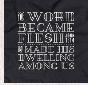
IOHN 1:14 SKII# 139