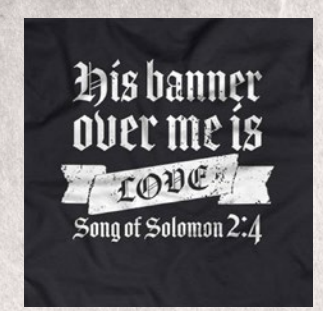
SONG OF SOL 2:4 SKU# 137