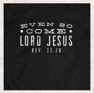
REV 22:20 SKU# 143