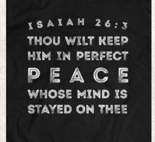
ISA 26:3 SKU# 144