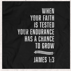
JAMES 1:3 SKU# 147